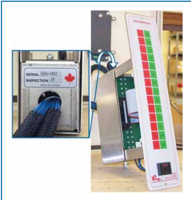
STANDARD REMOTE DISPLAY

Remember, if it does not say AQUARIAN, then you are not getting the proven product.