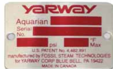
S/N TAG ON WATER COLUMN WHEN SYSTEMS WERE SOLD THROUGH YARWAY™ CORP.